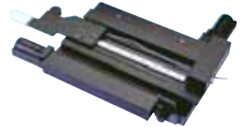
Shuttle Stage in load position