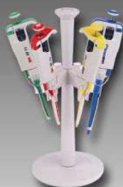
5445 (black) 5446 (grey)

In order to ensure convenient storage of pipettes, HTL offers a wide range of single and multiple stands.