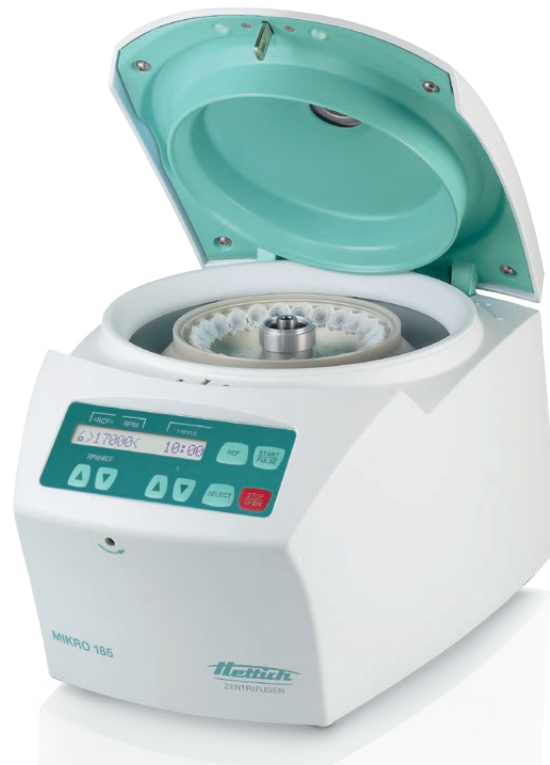
MIKRO 185 Microlitre centrifuge

Its compact dimensions mean that the MIKRO 185 takes up little space on the workbench.