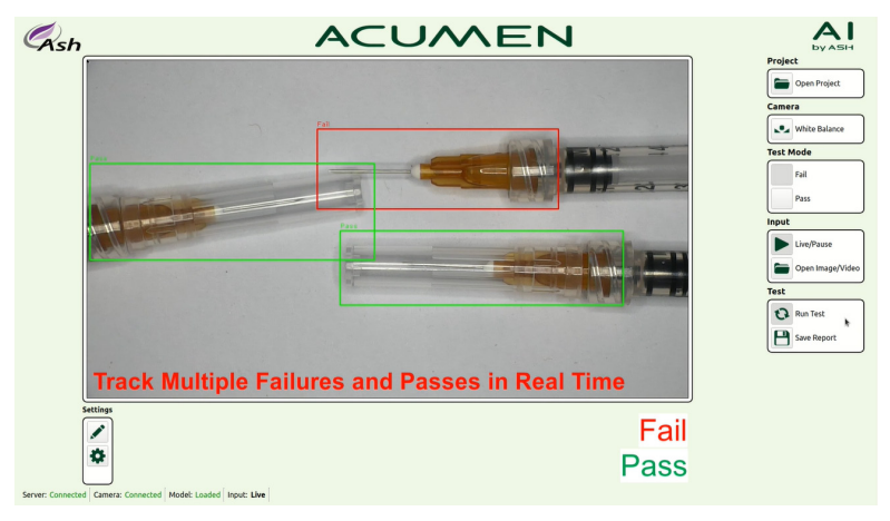
Acumen tracking needle failures in real time

Acumen is a new Artificial Intelligence (AI) machine learning platform from ASH. Acumen takes advantage of next generation deep learning fully designed and developed in house by ASH. Acumen is intelligent and intuitive – it can be used to automatically identify, detect, classify, and count a wide range of fully customizable defects. Implementing the power of Acumen will increase production efficiency, eliminate human error and ultimately increase production throughput.