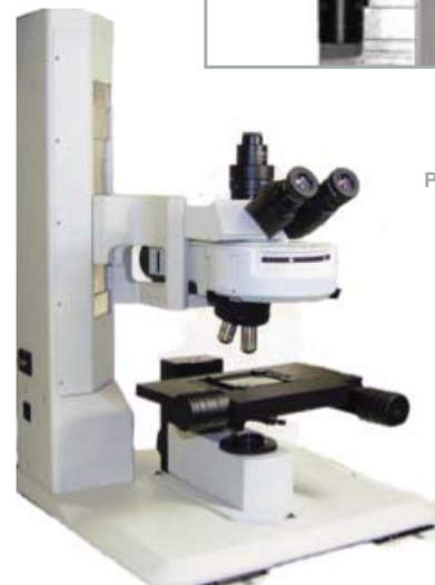
Pro Z stands

Prior Scientific Modular ProZ components offer a wide range of configurations to meet your Z focus and XY microscopy needs. Compatible with Prior ProScan and Optiscan control systems and Lumen and Lumen LED illumination systems. Three different stage mount options are available. A standard BX dovetail is available for basic reflected light applications. For transmitted light applications the ProZ Stand has options for both a brightfield/oblique transillumination module that uses a tiltable sliding mirror or a full Koehler illumination module.