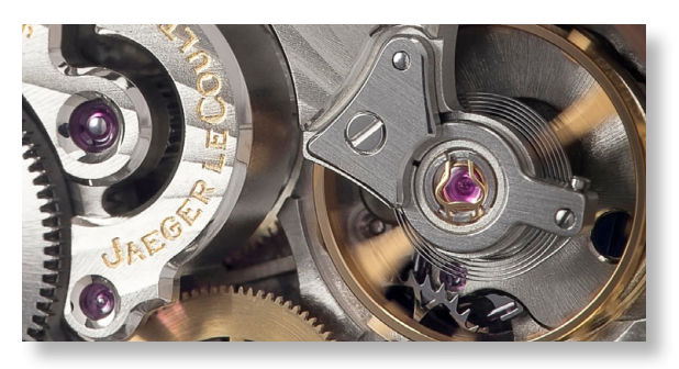
Micro mechanics, x20 Zoom, 31x Mag.

"Inspectis can significantly reduce the time you spend on inspecting parts"