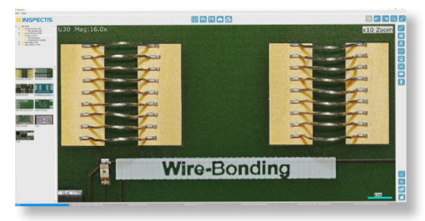
Bonding, x10 Zoom, 16x Mag. with ProX software

The system's standard optics produces ~ 1.9 - 56x magnification (on 24" monitor). If further magnification is needed, a wide range of diopter Macro Lenses can be added to magnify up to 170x.