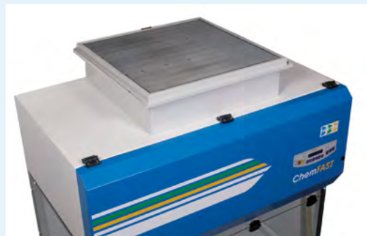
Additional filter housing re-circulating type